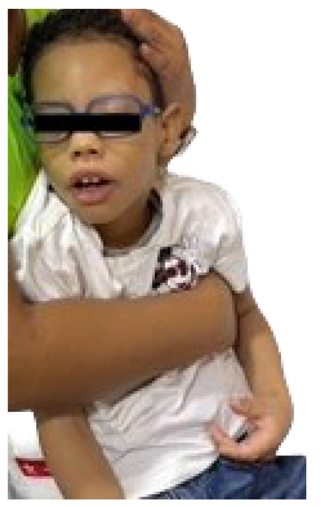
Patient is unable to sit independently, needs support from his mother to maintain seated position and above all to support his head.

Figure 1. Patient's facies and inability to sit up.